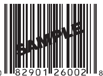
Sample 12-Digit UPC Code